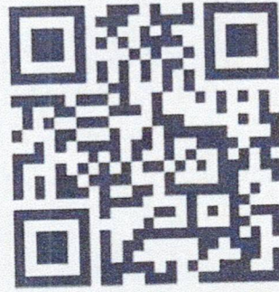
Facilitator's online Profile Form

Upon collecting the data, the BLSS-SSD shall generate a regional and division report to be sent to the Regional and Division Offices ESSD and SGOD Chief respectively.