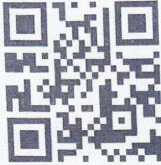
School Sports Information Management System (SSIMS) online Form